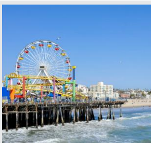
SANTA MONICA, CA

You'll spot the tall neon sign leading you to your next stop from miles away. Roy's Motel and Café in Amboy has made an appearance in movies and music videos including Enrique Iglesias' "Hero". It has also counted Harrison Ford and Anthony Hopkins as regular customers. Grab a bite to eat at Bagdad Café, in Newberry Springs, which was seen in the movie of the same name. For your final destination for the evening, head to the Mojave Desert city of Barstow. Here, you can visit the Route 66 Mother Road Museum, which has classic cars, artifacts from decades past and historic photos of the local area on display.