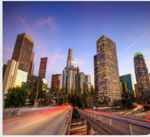
LOS ANGELES, CA