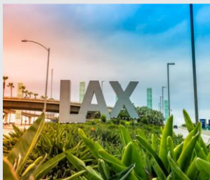
LOS ANGELES, CA

Take time to explore the eclectic neighborhood of Venice Beach and see fitness buffs working out in Muscle Beach's outdoor gym. Hike to the famous Hollywood Sign and take in the wondrous view of the city. Find your favorite celebrity's star on the Hollywood Walk of Fame, their handprint in the forecourt of the TCL Chinese Theatre, and their house on a tour of Hollywood stars' homes. Learn the secrets of movie magic on Universal Hollywood's Studio Tour where you can explore backlots and sets from movies and TV shows, and enjoy the rides, attractions and performances at Universal Studios and Disneyland.