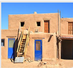
SANTA FE, NM

Get your Americana fix as you drive through Tucumcari, NM, to catch sight of an abundance of neon signs and over 50 vibrant murals throughout the city. In Route 66's heyday, these signs enticed weary travelers to stay at local motels and you can channel how they felt as you make your way to your hotel for an evening's stay.