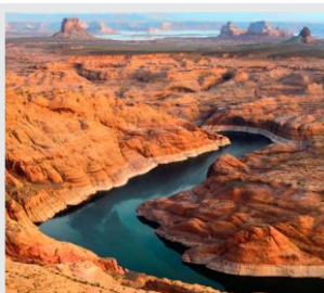
GRAND CANYON NP, AZ

District. Alternatively, you could walk the Route 66 Trail, an urban trail from the train depot to the east side of town.