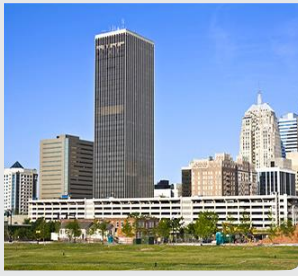
OKLAHOMA CITY, OK