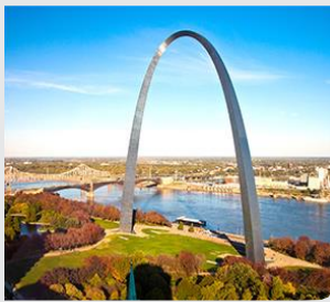
ST. LOUIS, MO